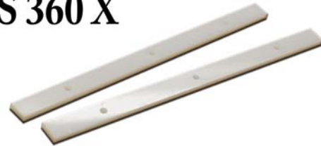
DS Adapter Shims (for deeper frames)