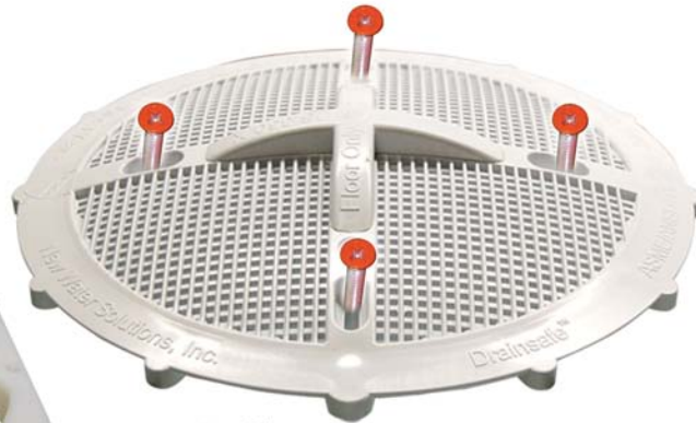
DS 360 X